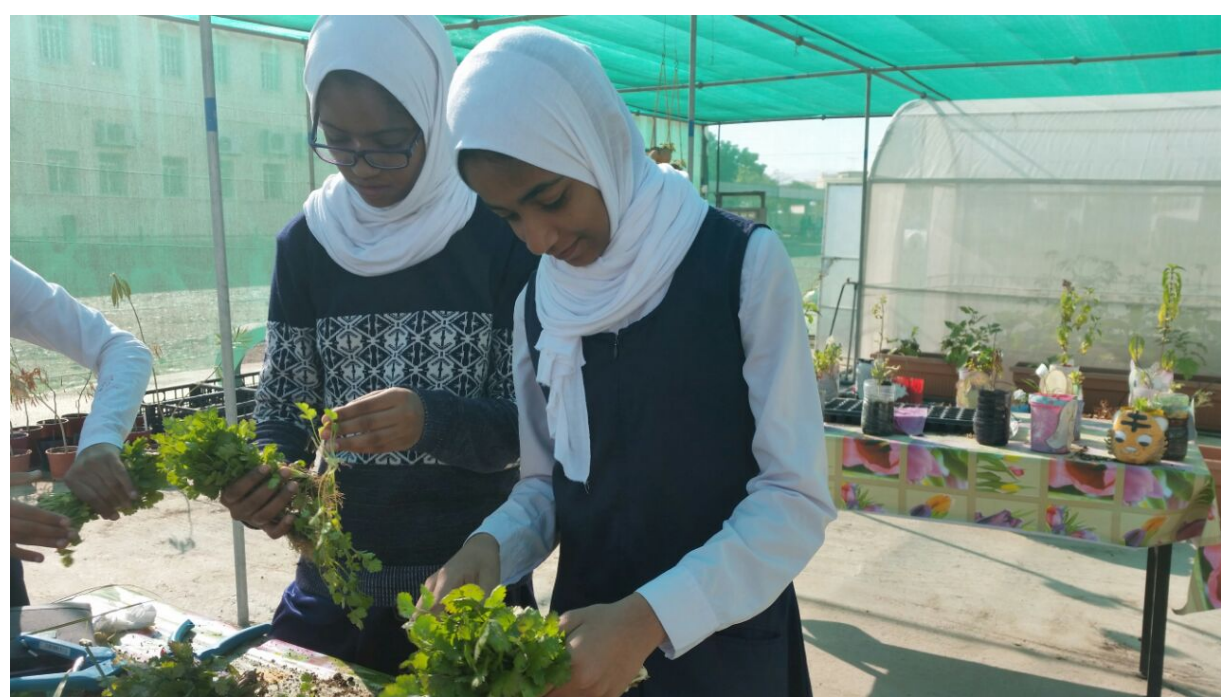
Figure 3. Grade 7 students sorting seedlings