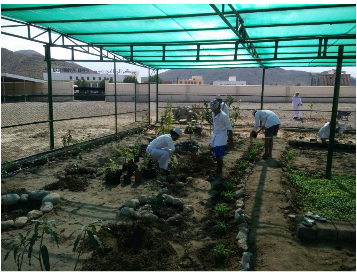
Figure 2. Grade 7 students preparing beds and planting school gardens